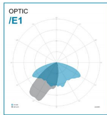
OPTICS: E1-MEDIUM ROADS